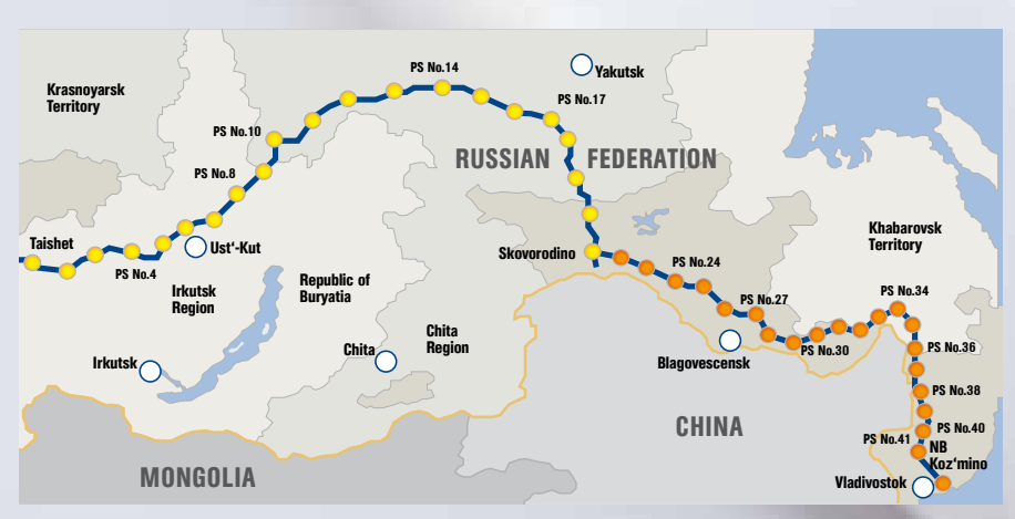
ESPO pipeline route from Taishet to Kozmino