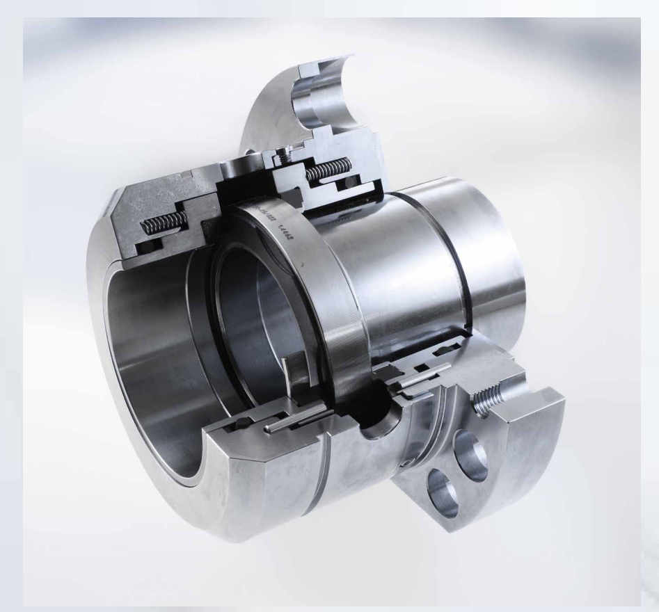
Successful seal design: EagleBurgmann SHPV-D (section model)

To meet the extremely high demands on the seal design reliably, FEA (finite element analysis) was applied to optimize the SH seals for fluctuating pressures, temperatures and speeds involved in operation and to ensure the optimum geometry for seal face and seat.