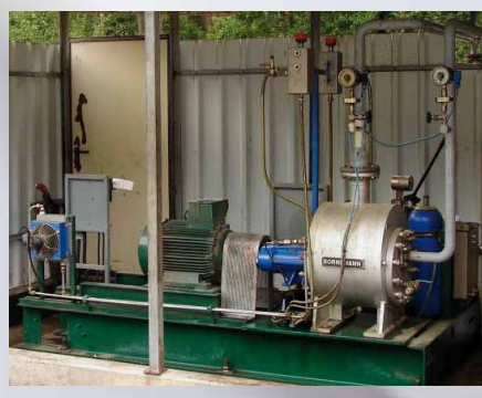
Bornemann SLM multi-phase pump