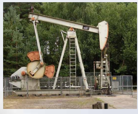
Oil rig in Northern Germany

With the DiamondFaces® coating on the seal faces and 5 % residual lubricating oil content in the medium, the seal has been running in the safe temperature range without leakage, and the user is fully satisfied with the results.