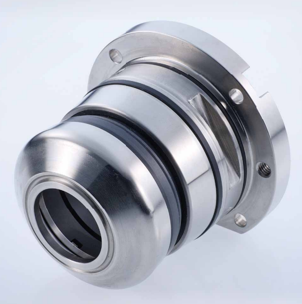
EagleBurgmann Type SGR mechanical seal

At 3.7 million tons a year, German production of crude oil covers about 3 % of domestic demand. The largest recoverable reserves are located in Northern Germany. Compared to other oil & gas producing regions, extraction and refining in Germany tend to be more challenging. Highly-optimized cutting-edge technology and processes along with very sophisticated extraction and refining equipment are needed to compete in the international marketplace.