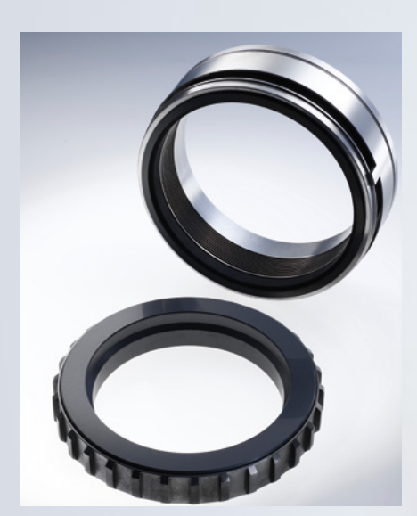
A MFL65 metal bellows seal (stationary unit and counter ring of a single seal) with the typical torque transmission for reducing stress on the bellows.

The Conoco Humber refinery on the east coast of England has been processing 85 million barrels of crude oil a year since 1969. This means that 230,000 barrels per day are processed mainly into benzin, diesel, kerosene, oil, gas.