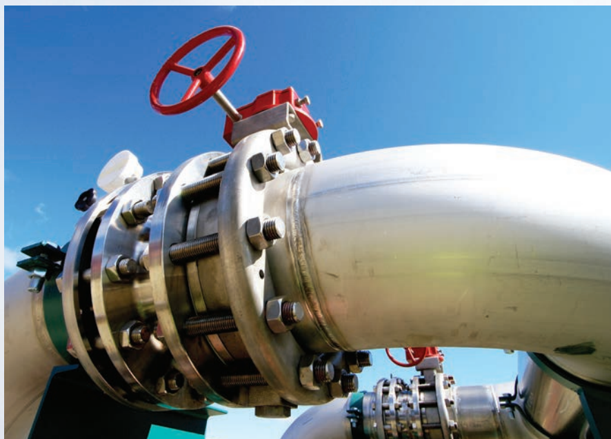
EagleBurgmann develops custom tailored sealing solutions for pipelines.

These requirements were best met by the SHV series which has proven itself thousands of times over in crude oil pumps and MOL pumps