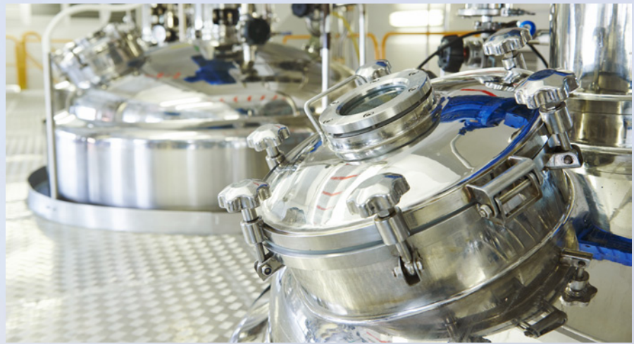
A number of seal families in the EagleBurgmann range meet the demanding requirements in the pharmaceutical industry.

For the customer, EagleBurgmann replaced the seal face and stationary seat with versions with the DiamondFace coating. Due to this coating's fantastic sliding properties, grooves were not necessary, which, incidentally reduced the leakage rate of the seal. The seal now appears to be entirely insensitive to inadequate lubrication but, even without grooves, the leakage rate still exceeded the desired values that could be achieved with the conventional SiC version (as previously used). A significant part of the problem of reducing leakage was resolved by polishing the sliding faces to suit the application. The barrier pressure was also reduced, so less barrier medium was supplied to the seal. With the DiamondFace coating, the sliding faces were unaffected by this. In the end,