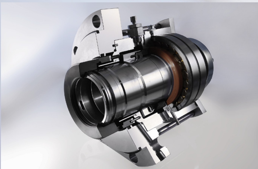
Smooth surface and free of dead spaces – the mechanical seal MR-D is perfectly CIP and SiP capable.

After in-depth examination of all the potential technical solutions, EagleBurgmann was able to leverage experience gained with specially-coated seal faces for use in multi-phase pumps and apply it to the fermenter agitator. Seals in multi-phase pumps are again susceptible to