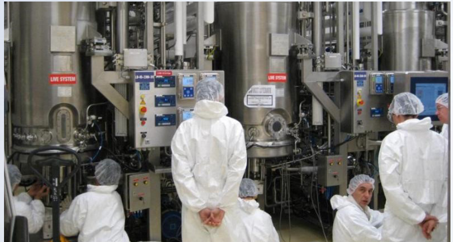
Technical inventory on site

EagleBurgmann used the HSMR333 sterile version of its MR-D liquid-lubricated double seal as this is ideal as a top, side or bottom-entry seal for agitators. The smooth surface contour